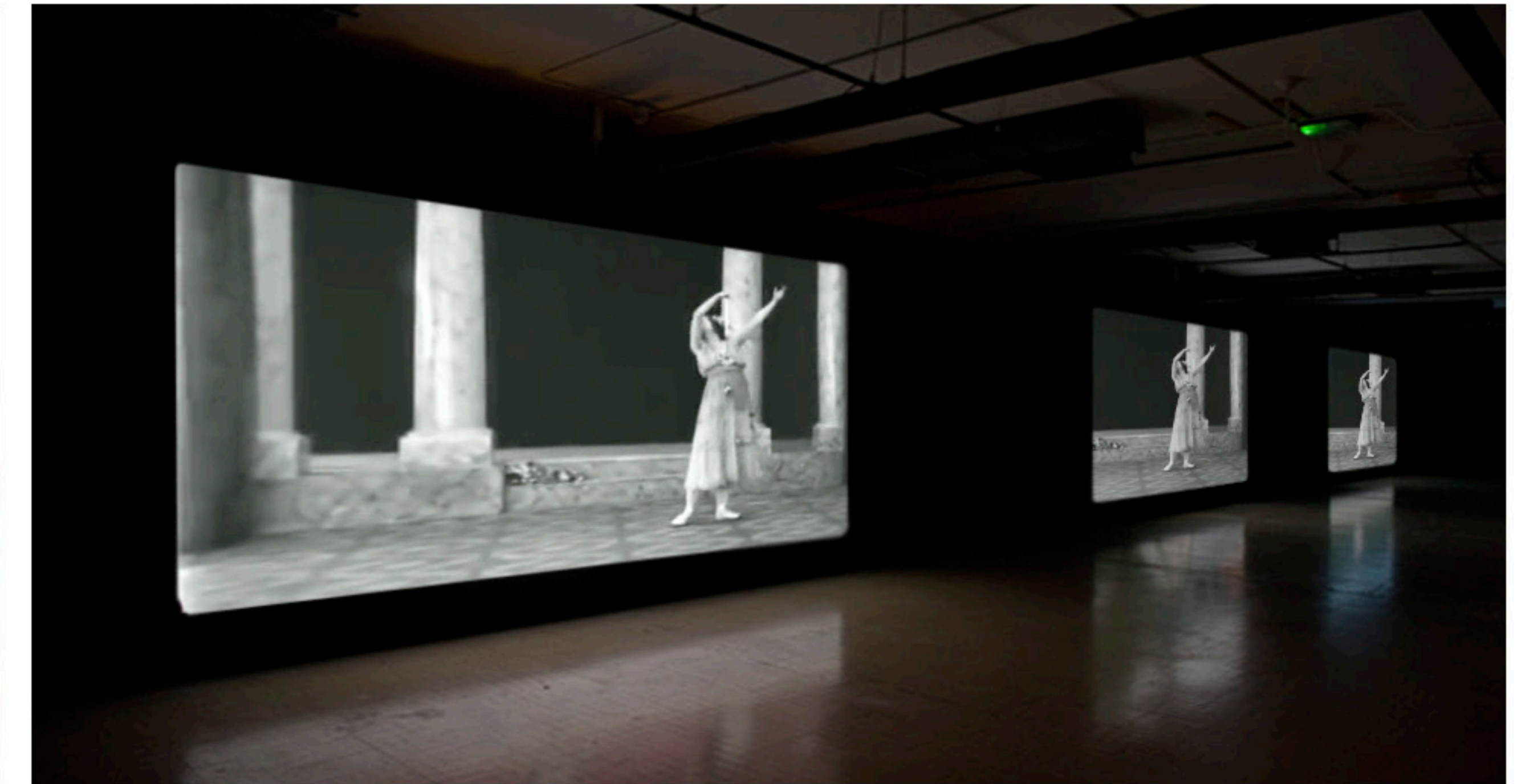
potential location references / suggestions